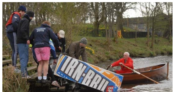
The fridge is removed from the river