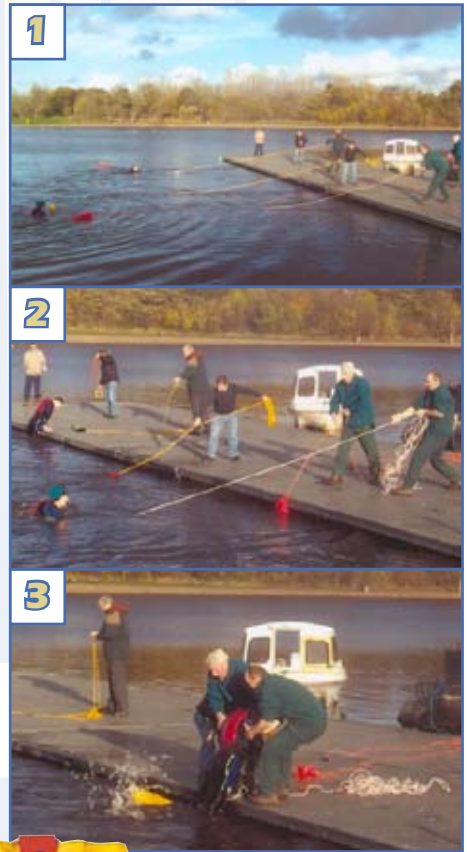
B-Line was tested and proved to be the most effective in a water rescue situation.

We are grateful to Glasgow Humane Society for the kind help given in the production of this case study.